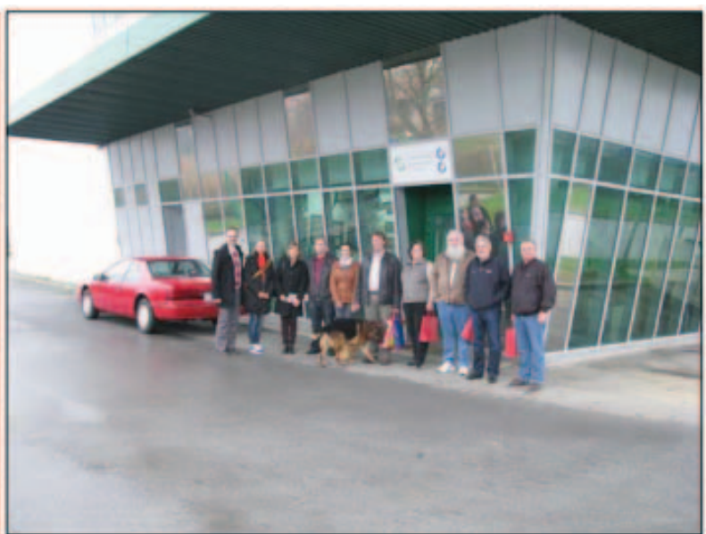
Delegation from City of Cambridge pictured with Mayor of Beli Manastir and Cortec's team in front of EcoCortec® plant.